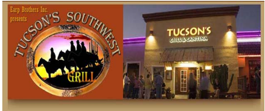
Tampa Bay Chapter FSMS November Meeting Location